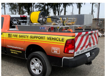
Multiple size & bed options