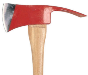
Rigged for USFS & Calfire