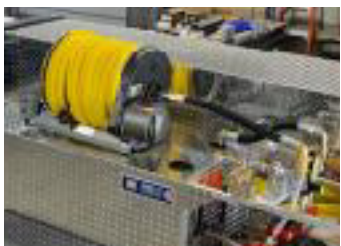
Pre-connected hose reel